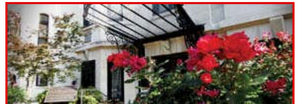
GFWC Headquarters in Washington, D.C.