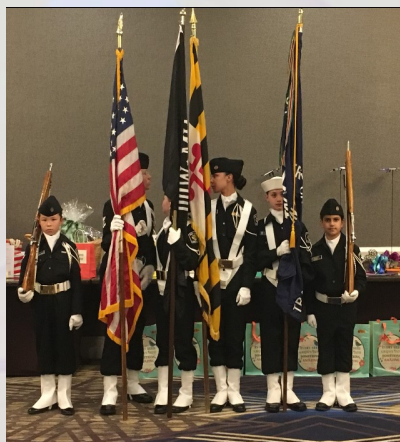
Opening Flag Ceremonies