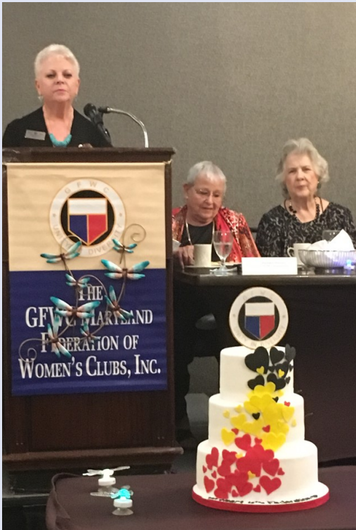
Special Thank You to the GFWC Maryland members for their hard work hosting the 2015 SER conference and the 2016 GFWC Convention!