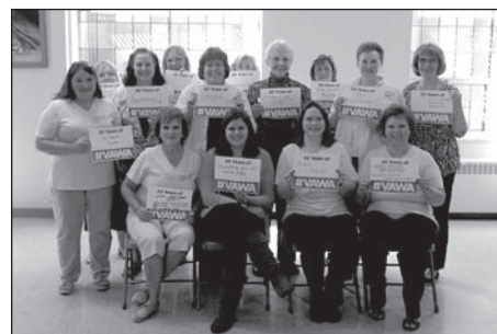
What does 20 Years of VAWA mean to you?