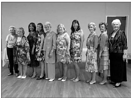
Cecil County Club Members serve as models for their Spring Fashion Show.