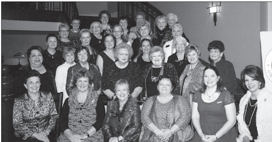
The GFWC Maryland Delegation

November 6-9, 2014 at MeadowView Marriott in Kingsport, TN