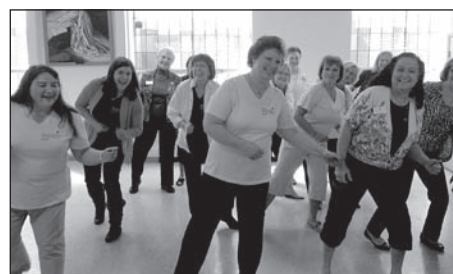
Doing the "Electric Slide"!

More Information will be included in the Official Call