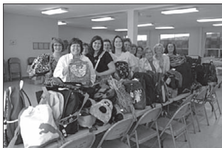
Service Project: Suitcases for the Future