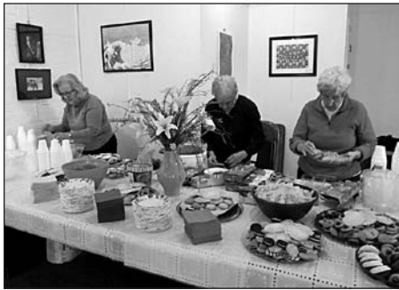
Members prepare refreshments for students and parents at the Cecil County Club's Annual Youth Art Show.