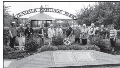
Woman's Club of Dundalk members at their Spring Wreath Ceremony and Presentation at Dundalk Heritage Park.

Domestic violence issues are addressed through our donations to