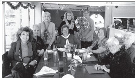
Woman's Club of Dundalk members at their Annual Christmas Wreath Ceremony and Luncheon.

and auction, and a "bake shoppe." Sales are brisk and lots of laughs are shared, especially when remaining items are auctioned. Items that do not sell are donated to a local charity.