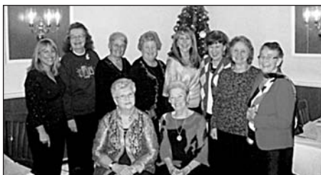
Members of the Woman's Club of Perry Hall attend their Christmas get-together at Pappa's Restaurant.

E—is for our ETERNAL gratefulness for the people we have met; for the worthwhile causes we have supported; for the comfort and caring we have nurtured; and for having been clubwomen through the ages!