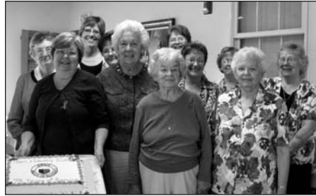
Members of the Town and Country Club of Greensboro celebrating 75 years of service.

As we welcome the New Year and prepare for our wonderful Miss Pocomoke Pageant, I would like to reflect on the Pocomoke Juniors' accomplishments for the past year. Since our last Miss Pocomoke Pageant and GFWC-MD Convention we have been very busy with Family Reading Day, Relay-for-Life, Cypress Festival, Brand Name Bingo, Downtown Christmas Celebration, Santa