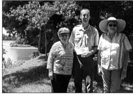
During their field trip to Wye Island, members of the Wicomico Woman's Club present a donation to the Park.

April found our club celebrating our 92nd Birthday with entertainment from a local group, The Folk Heroes, who played a variety of instruments and sang several songs. We also voted to sponsor a local girl in need for a day camp to be held in July. Later in April, several members attended GFWC-MD Convention in Baltimore where we were honored and proud to receive seven awards.