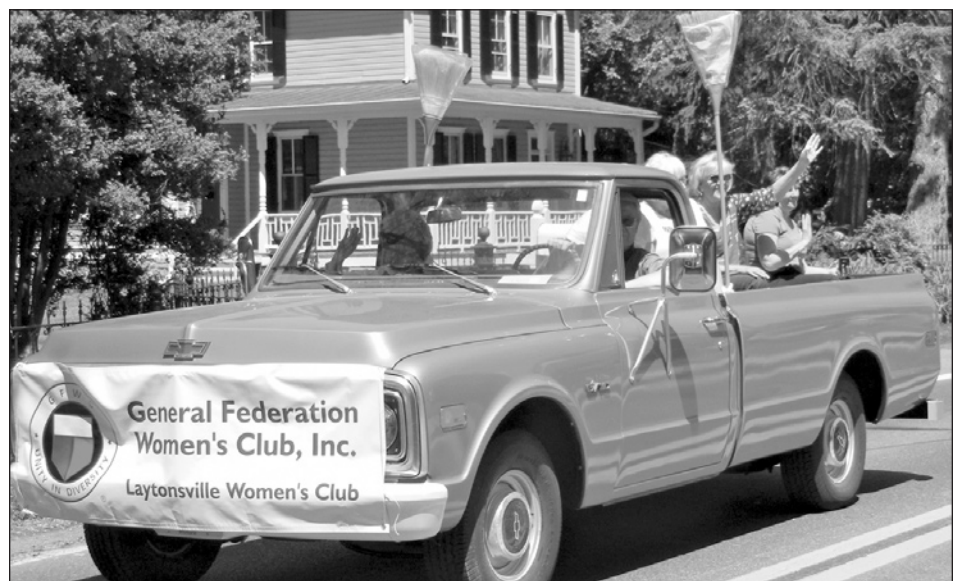
Laytonsville club members in our "float" at the town parade.

In the spring we are looking forward to more hands-on service activities, and some membership activities as well. Plans are underway for a second yoga retreat on the Chester River, more golf outings and our annual salad luncheon/dinner. A perfect way to get to know our three new members that joined in the fall!