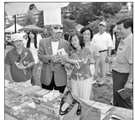
The GFWC Chinese Women's League Metropolitan DC Chapter celebrates the 10th Anniversary of their Dragon Boat Festival.

The festival concluded with the award ceremony on Sunday afternoon. Teams received their medals and trophies and paddlers proudly displayed them. This festival brought together friends and families; it also celebrated the diverse culture in our community and highlighted the teamwork and sportsmanship of the event.