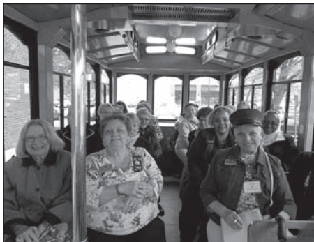
The Discover Annapolis Trolley Tour.

Saturday afternoon, clubwomen enjoyed the Discover Annapolis Trolley Tour. We met in the hotel lobby around 2:00 p.m. and rode