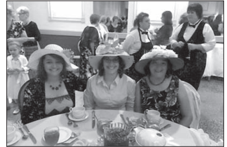
Ladies enjoying the Joppatowne Woman's Club's Annual Tea.

International Outreach—Our new chairman and her co-chairs have made contact with a couple of international companies, one of which is The Root Collective, an online shop with a variety of cute shoes, handbags and jewelry. The founder, who lives in Towson, works with artisans in Guatemala to get their products to America. They give back 10% of the profits to non-profit organizations in their communities. SERRV has connections with artisans and farmers worldwide. This is a 65 year old organization that is helping to break the cycle of poverty.