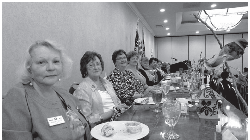
Honorary Presidents of the Federation attending the "Leaders of the Flock" Luncheon.