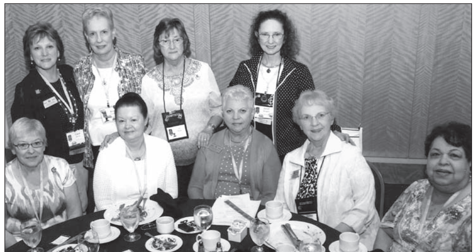
Enjoying time with Federation friends at the GFWC Southeastern Region Luncheon.