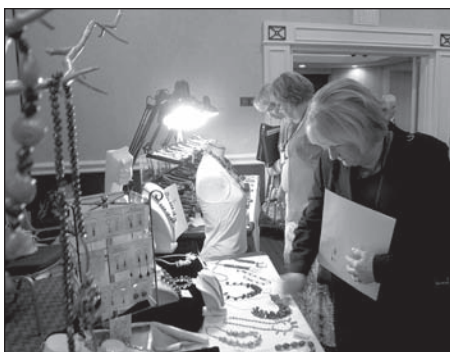
Members enjoyed shopping with some of our favorite vendors.