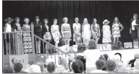
Members and friends model in the Glyndon Club's Fashion Show.

Recognizing responsible students and understanding the roadblocks of financing a college education, the club once again awarded two scholarships to deserving students.