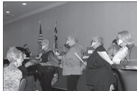
The GFWC-MD Officers entertained with their "Rockin' Robin" skit.