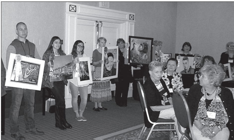
Congratulations to the 2015 GFWC Maryland Youth Art Contest Award Winners!

on the trolley for an hour tour of the streets, marinas and points of interest in Annapolis.