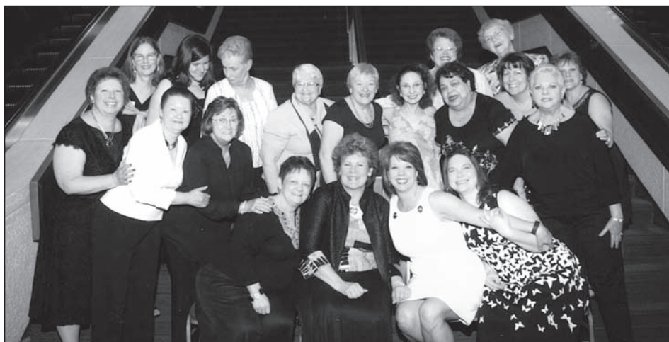
Maryland Girls just want to have FUN... at the GFWC Annual Convention!