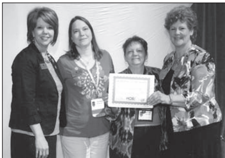
GFWC Maryland proudly receiving a Certificate from HOBY.

Monday morning workshops were held prior to the business session. Of course, there were more changes to Bylaws and Resolutions, followed