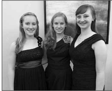
Members of the STARS Juniorette Club of Westminster gather for Saturday’s “Celebrating Membership” Banquet.