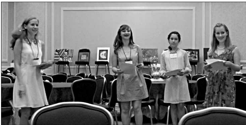
The Westminster STARS Juniorettes presenting their Junior Day report

It is my hope that more people will attend the 2014 Annual Convention, to be held April 4-7, 2014 at the BWI Airport Marriott. Our attendance this year was 11% of the Junior membership and 7% of the General membership. Let’s try to double that next year and see if we can make it 35% of the state membership. Mark your calendars now—I would love to see you there!