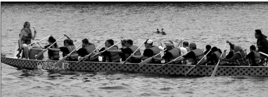
Dragon Boat races on Day Two of the 12th Annual Washington, DC Dragon Boat Festival, organized by the Chinese Women's League

The festival started out with a Lion Dance accompanied by cheerful