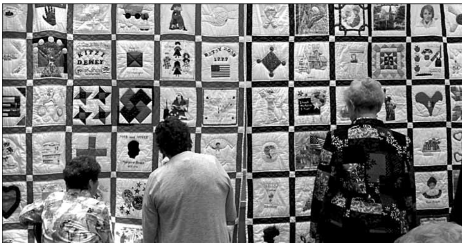
Members enjoyed viewing the “Spirit of the American Woman” Quilts.

Final reports were given by the Credentials, Registration, and Reservations Chairmen. The Convention Committee was presented and, after The Collect for Clubwomen, the 114th Annual GFWC Maryland Convention was adjourned.