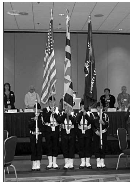
The Navy League Cadets