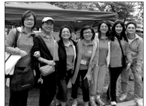
Members of the Chinese Women's League at the Dragon Boat Festival