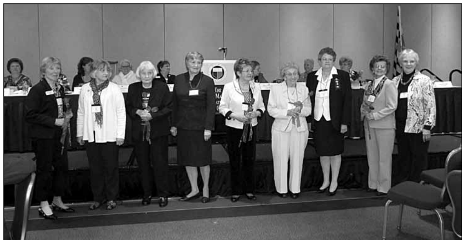
Nominees for the Outstanding Maryland Clubwoman Award—They’re ALL Winners!