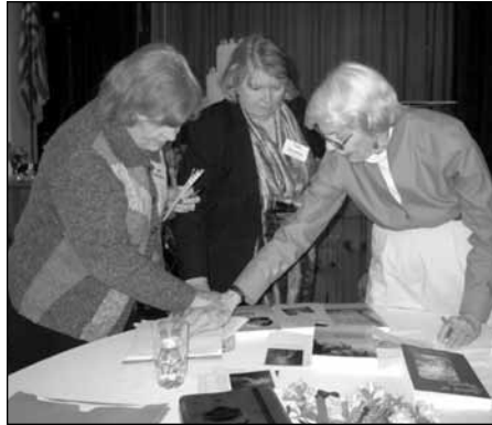
Woman's Club of Chevy Chase members gather around one of their luncheon speakers to purchase signed copies of the author's books.

In March, we held an Art & Craft Show and Sale, featuring more than 33 local artists—an event that is becoming a regular part of our calendar. We also hosted our 38th Art Show & Sale in April, an annual event that is