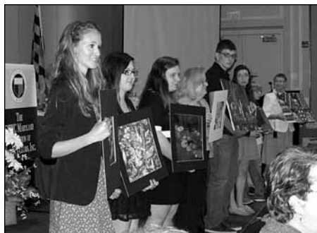
Congratulations to the 2013 GFWC Maryland Youth Art Contest Award Winners!