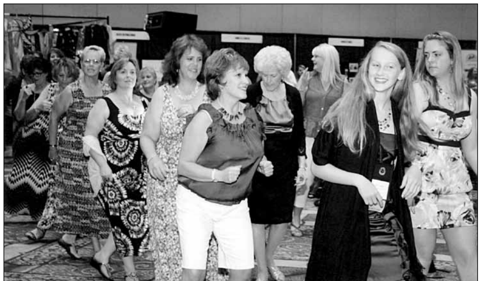
“Where the Girls Are” Junior Fun Night

What a way to close out the 2013 GFWC Convention—with the “Heart of GFWC” Banquet and Red Dress Fashion Show! After giving an informative presentation on prevention and treatment of cardiovascular issues in women,